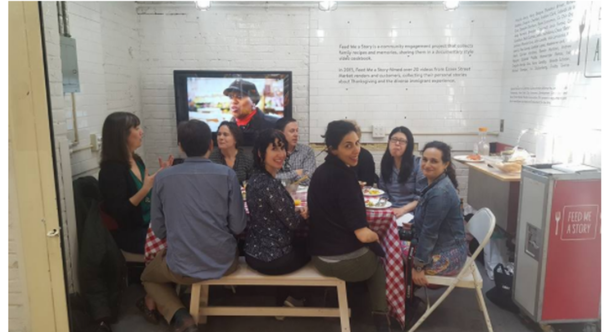
Essex Street Market.